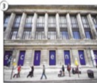
The Science Museum